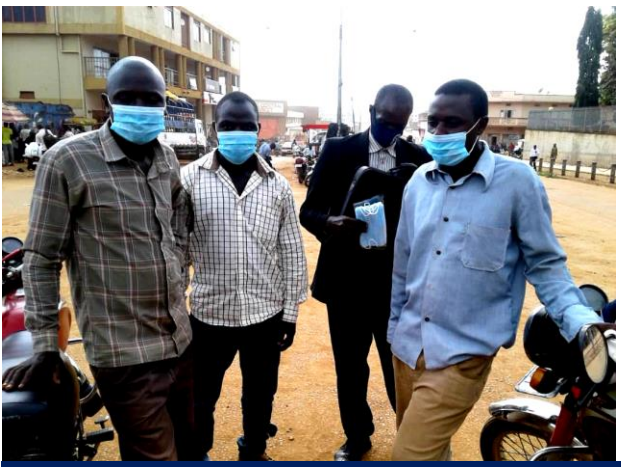
The CIDD-UG civic educator (in black coat) engaging boda-boda riders-Mbale City

During the period under review, CIDD-UG also conducted broadcast of peace audio messages in the five Districts of Mbale, Budaka, Kibuku, Butebo and Pallisa including Mbale city. The messages were able to create critical debate on the need to ensure calm after the 2021 contested election results.