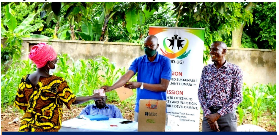
L-R One of the group representative receiving the seed funds from Deputy CAO Pallisa and witnessed by the District Natural Resources officer & Executive Director for CIDD-UG

the Active Citizen COP26 project. The organization was able disburse financial support to three community groups in Pallisa District to support small social actions that contribute to enhancing climate change mitigation and adaptation.