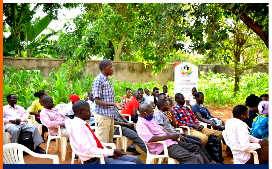
CIDD-UG constructively engages young people and media on post 2021 democratic process

CIDD-UG engages 300 young people and the media on constructive post-election conflict resolution through Dialogue.