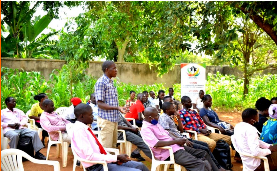
CIDD-UG constructively engages young people and media on post 2021 democratic process

The re-introduction of multiparty politics in Uganda has witnessed an increase in violent and non-violent conflicts to a greater or lesser degree before, during and after Uganda's general elections. The pattern and character of the conflicts are symptomatic of deep-rooted ethnic and partisan related hostilities that lie latent and mainly explode into violent conflicts before, during or after elections. The population and the most affected are youth and women who form a 75% majority population. The violent conflicts have also compromised the tenets of Democratic Governance.