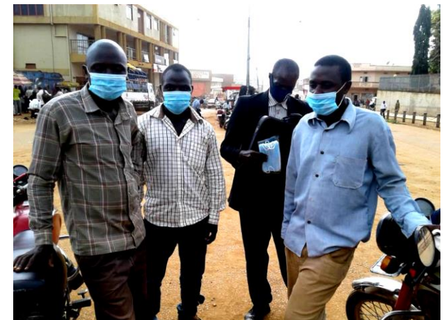
The CIDD-UG civic educator (in black coat) engaging boda-boda riders-Mbale City

During the period under review, CIDD-UG also conducted broadcast of peace audio messages in the five Districts of Mbale, Budaka, Kibuku, Butebo and Pallisa including Mbale city. The messages were able to create critical debate on the need to ensure calm after the 2021 contested election results.