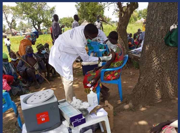
COVID-19 Vaccination Drive in Napak District