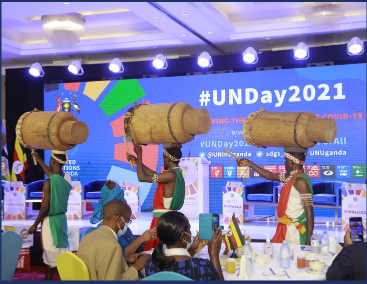
UN Day Drums