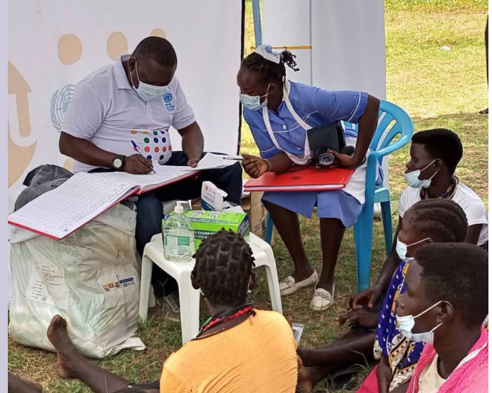
On the right UN staff and the health worker at the medicine dispensing point