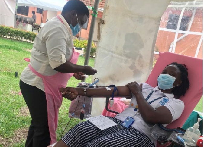
UN Staff participate in a blood donation drive during the UN Day celebration