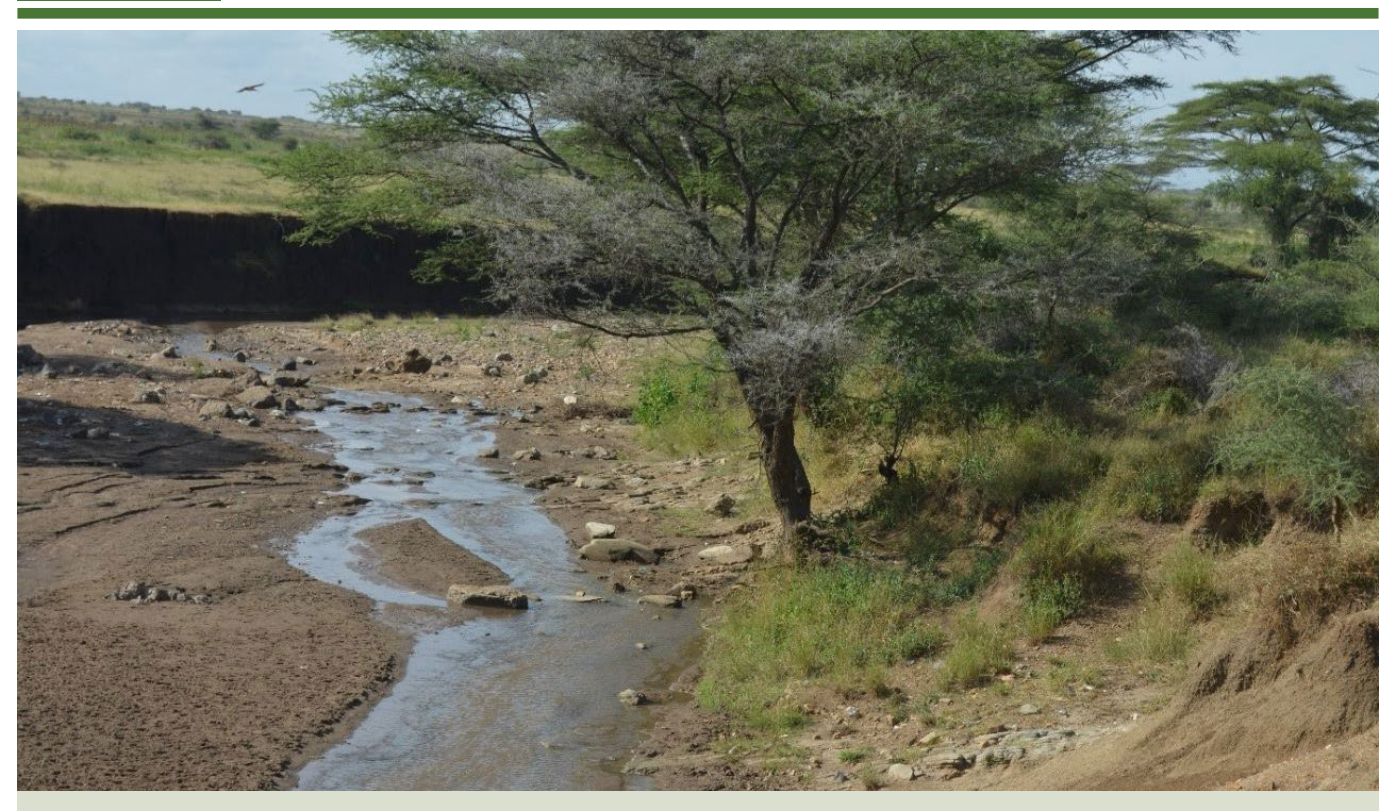
A drying stream in Moroto, North Eastern Uganda© UNDP

By Joel Akena, United Nations Development Programme (UNDP)