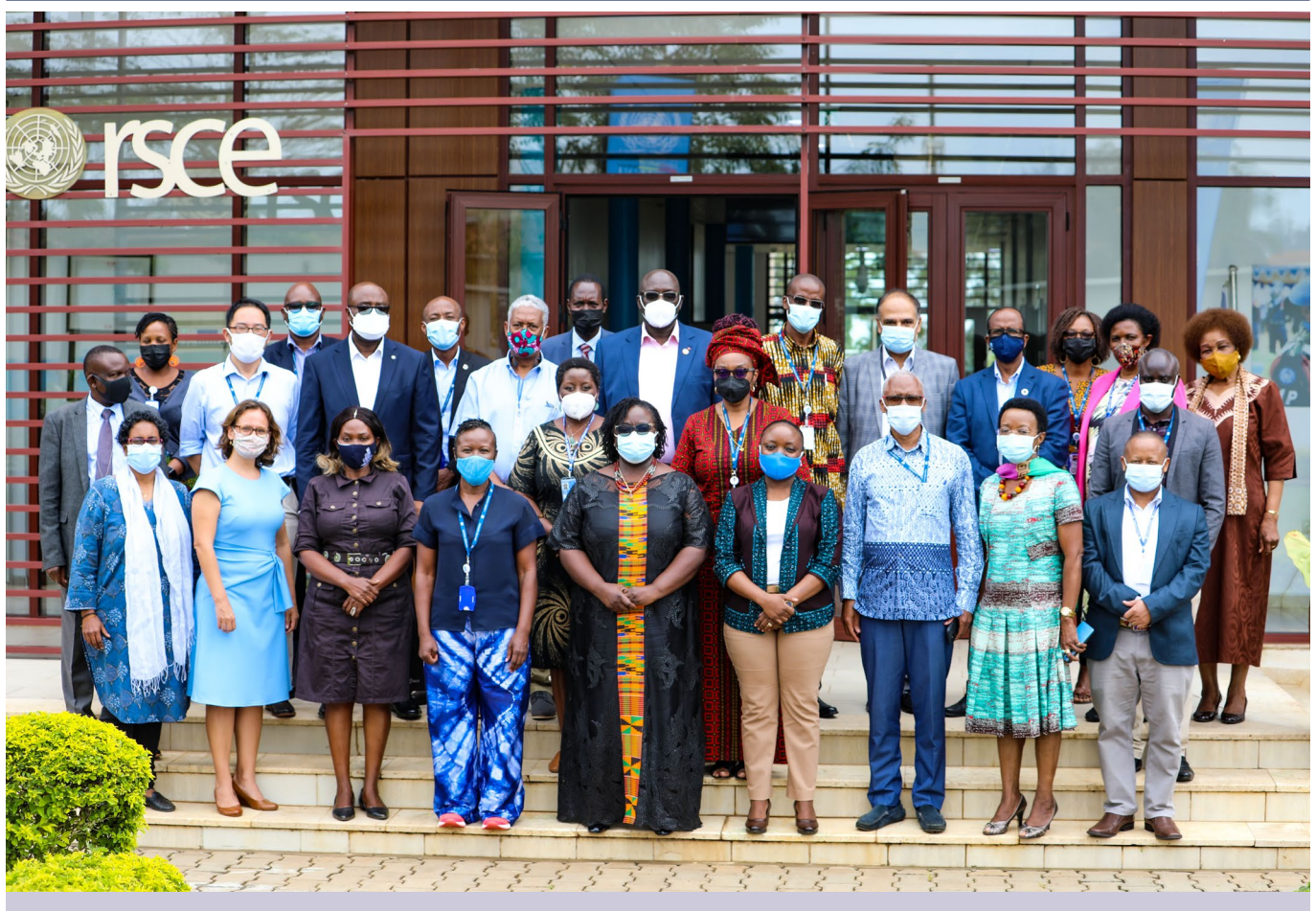
UN Country Team members at their retreat at the Regional Service Centre Entebbe (RSCE) on 30th September 2021