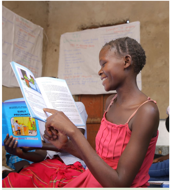
Amidst the COVID-19 pandemic girls are mobilised to join Empowerment and Livelihood for Adolescents clubs where sexual reproductive health and rights are discussed

According to UNICEF estimates, Ugandan school children have gone more than 300 days out of school since March 2020. As a result, adolescent girls have been deprived of the social protection that school offers and have been exposed to sexual violence, exploitation and abuse, child marriages, and teenage pregnancies.