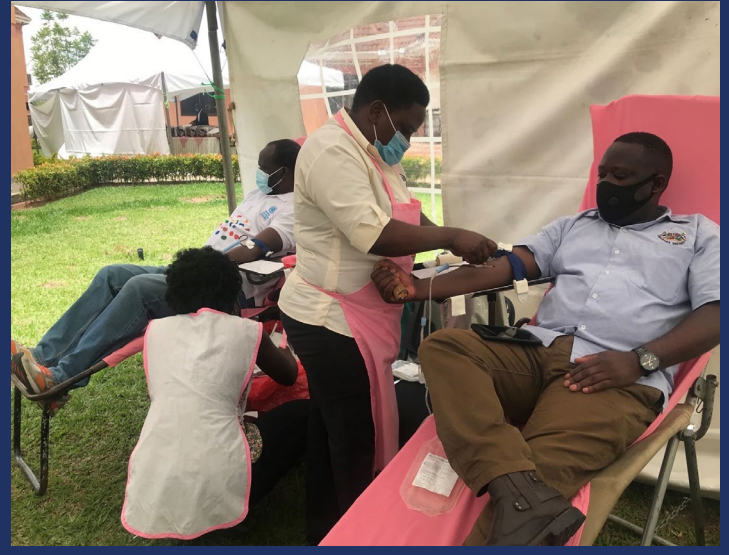
Blood Donation Drive in Mbarara