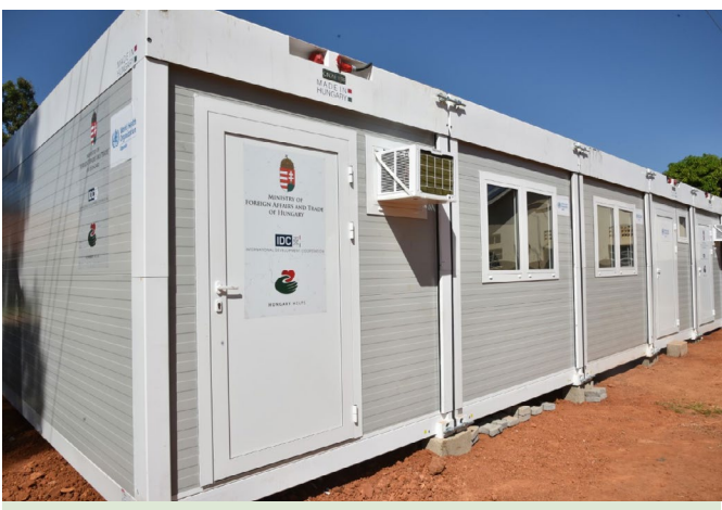
Mobile medical equipment container established at Soroti Regional Referral Hospital

The Government of Hungary in cooperation with the World Health Organization (WHO) has provided a mobile, rapidly deployable container structure, fully equipped with the appropriate medical equipment to support rapid and effective clinical management of severe and critically ill patients with highly infectious diseases in Uganda.