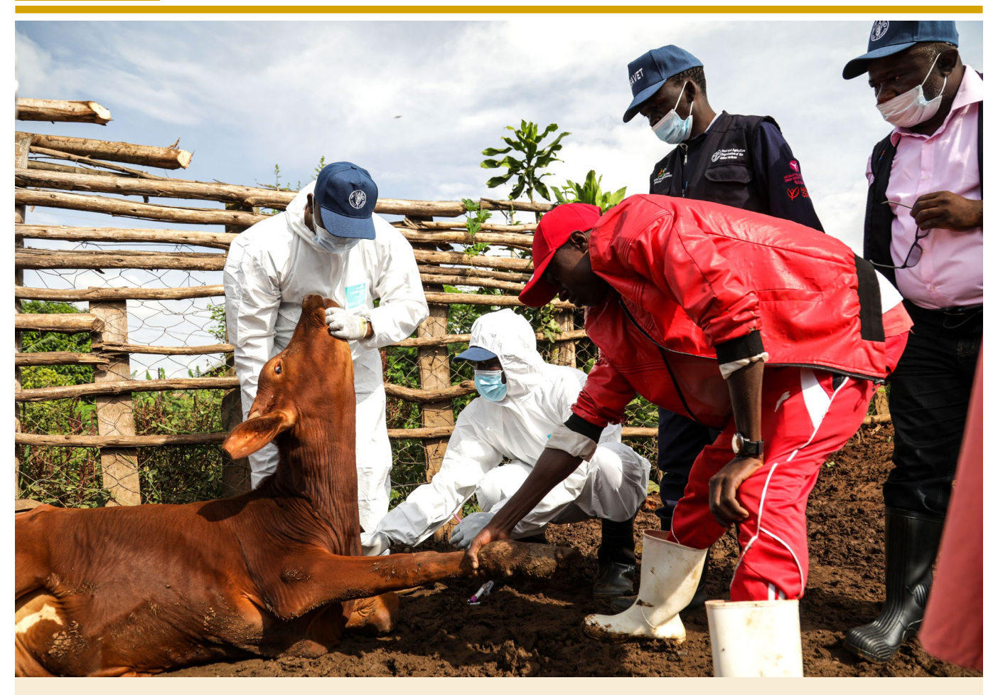
A team of veterinarians and paravets during the training in surveillance, disease outbreak investigation, risk communication and reporting in Luwero

By Agatha Ayebazibwe and Yanira Santana, Food and Agriculture Organization (FAO)