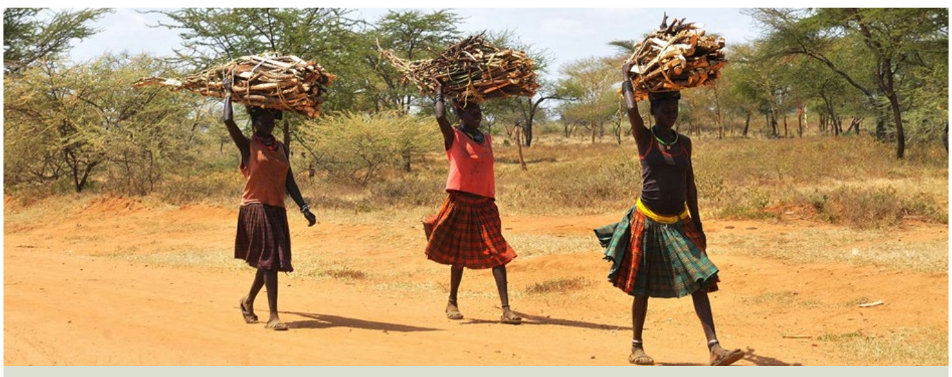
Women carrying firewood in the semi-arid area of Kotido District

The ACW is part of Regional Climate Weeks organized annually in Latin America and the Caribbean, Africa, Asia and the Pacific and Middle East and North Africa as platforms for government and non-Party stakeholders to address climate issues under one umbrella and unity of purpose. They seek to bring together diverse stakeholders from the public and private sectors to address complex climate change challenges. \bigcirc