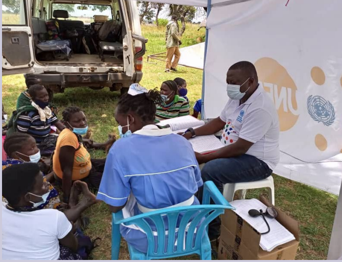
Trying to create privacy as we offer Antenatal health services at the health camp