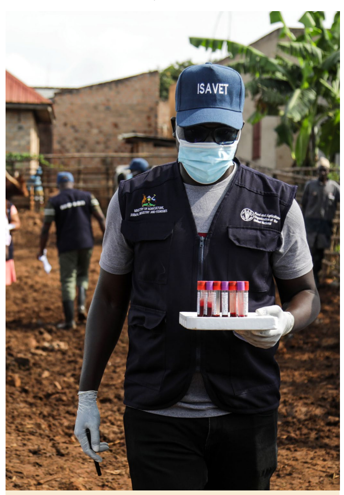
A trainee during the training in surveillance, disease outbreak investigation, risk communication and reporting in Luwero

This second cohort of ISAVET trainees follows the successful first edition of the programme, in which 20 district veterinary officers from 17 districts were selected to build the capacity of in-service field-level (frontline) veterinarians, creating a critical team of skilled frontline workers and experts who can conduct effective surveillance and outbreak response. •