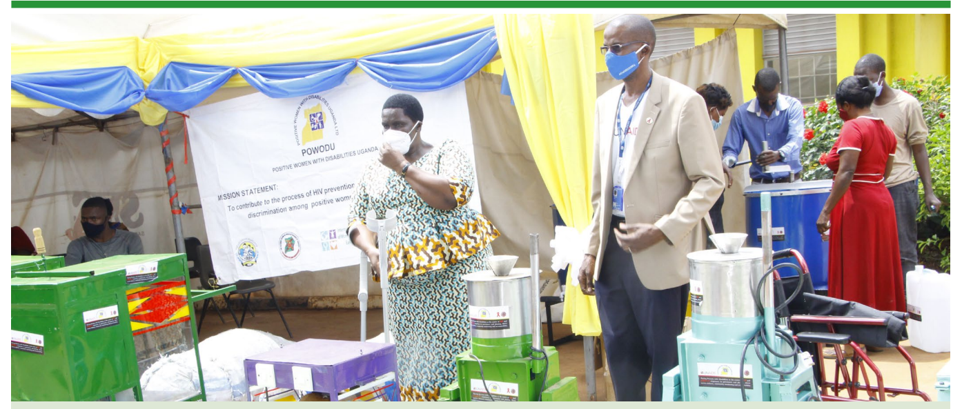
The Minister of State for Disability Affairs, Hon. Hellen Grace Asamo, together with UNAIDS OiC, Jotham Mubanginzi, officiating at the handover ceremony of economic empowerment equipment to group members

Globally, women with disabilities experience significant challenges in accessing health care. They face stigma and discrimination in families and communities, they lack transport to health care facilities and are faced with poor attitudes by health workers when they try to access care and these situations impede their access to health care.