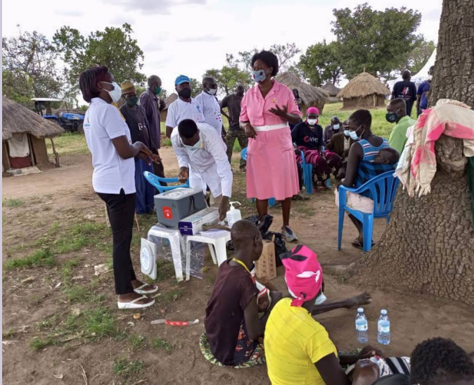
Health workers offering COVID-19 vaccination at the Health Camp