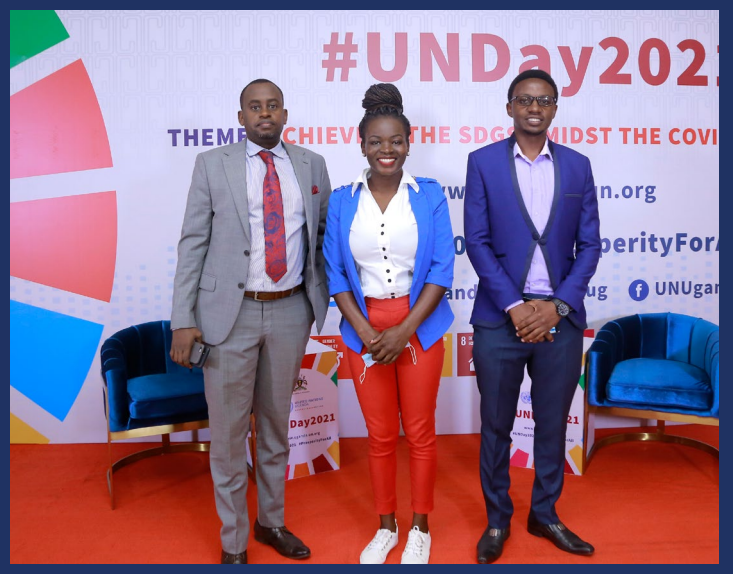
UN Day Youth