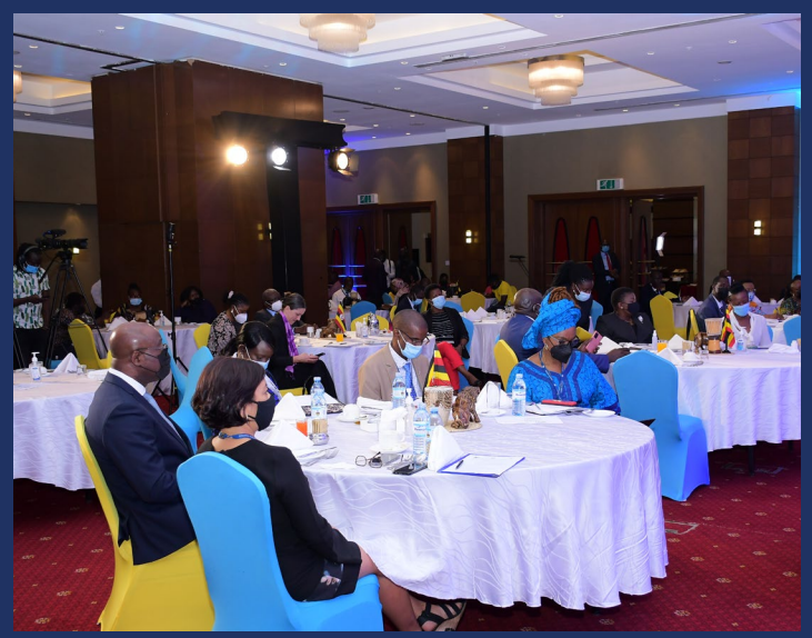
UN Day Guests