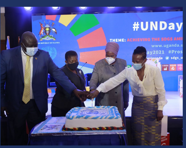
UN Day Cutting the Cake