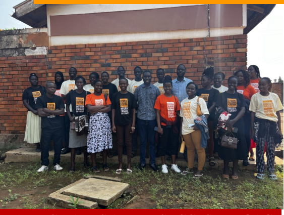
PARTICIPANTS AFTER SUCCESFUL OAG CFP TRAINING