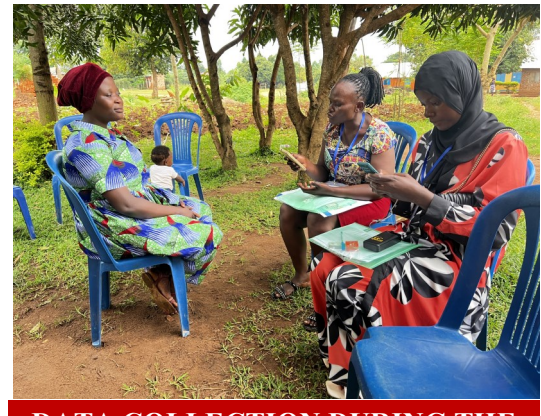
DATA COLLECTION DURING THE ELANA PROJECT