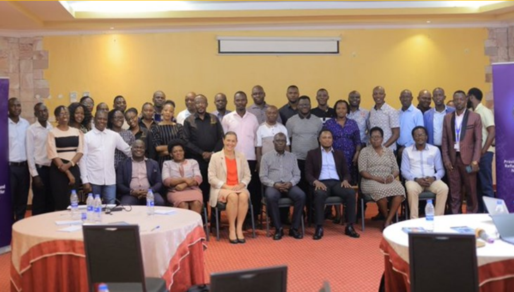
Participants pose for a photo with DANIDA representatives During SCEPA project inception

contribute towards an organized and engaged citizenry actively holding public institutions accountable will be implemented by selected partners CSOs in the fourteen subregions in Uganda, with CIDD-UG taking lead in its implementation in Bukedi sub region.