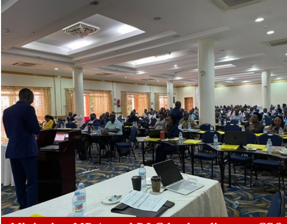
Ministries, MDAs and DLG leaders listen to CSO alternative budget position pater.

The space created by CSBAG and utilized by key CSO actors provided an opportunity for CSOs to filter through citizens voices to redirect government priorities in the FY 2025/2026.